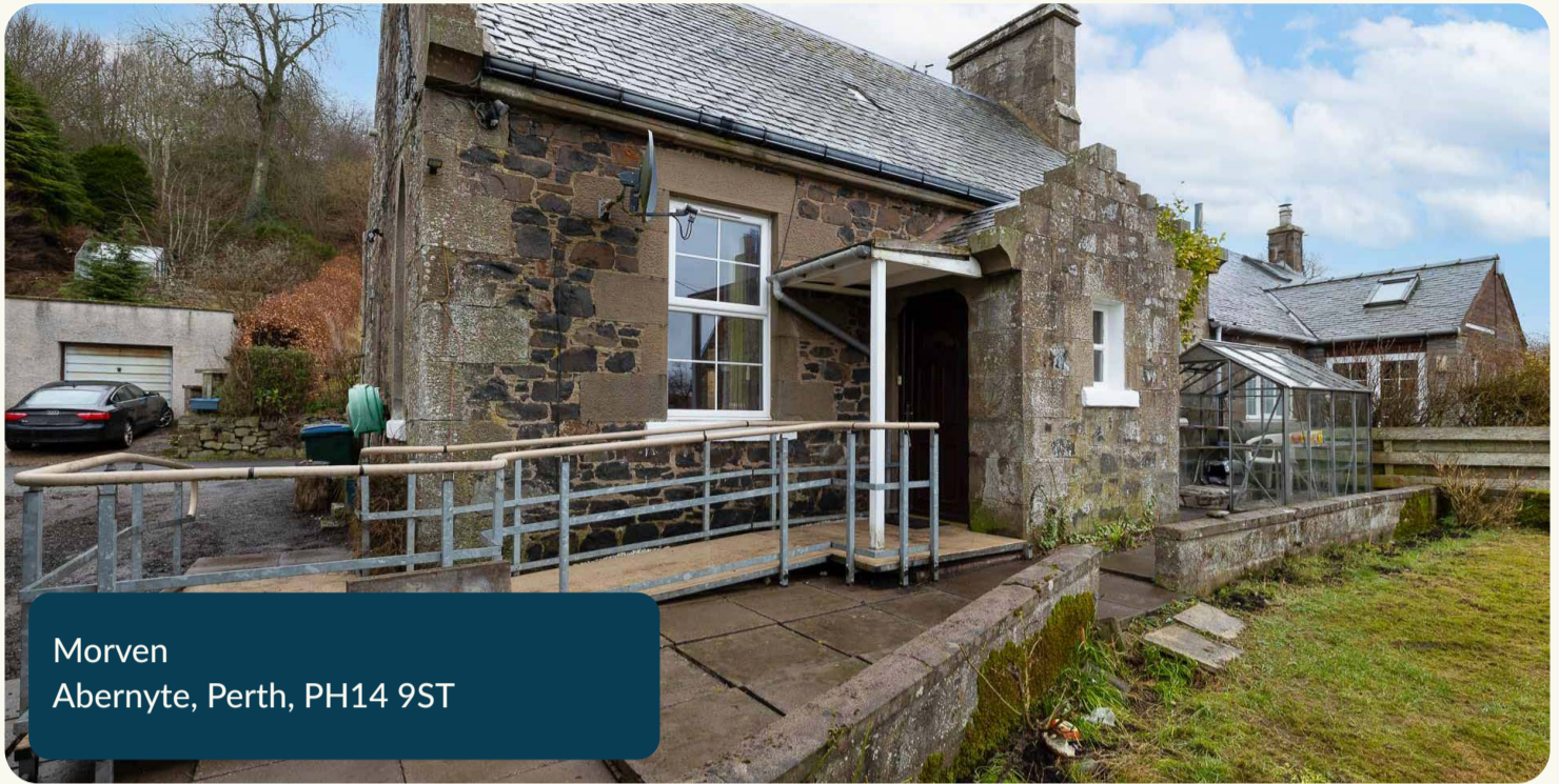
Morven Abernyte, Perth, PH14 9ST