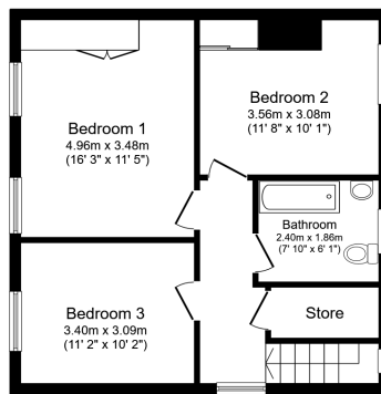
First Floor Floor area 51.3 sq.m. (552 sq.ft.)

Total floor area: 102.7 sq.m. (1,105 sq.ft.)