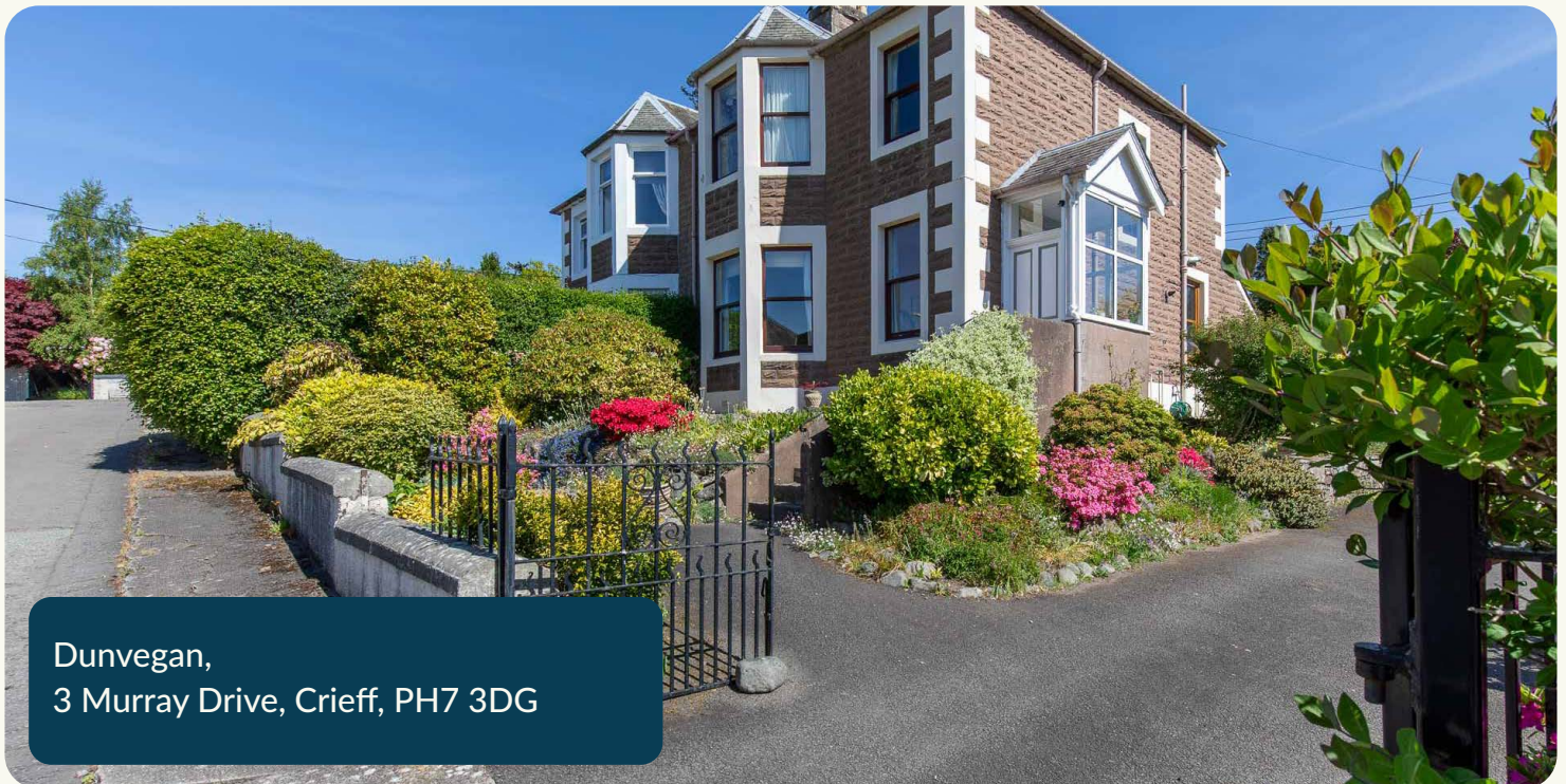
Dunvegan, 3 Murray Drive, Crieff, PH7 3DG