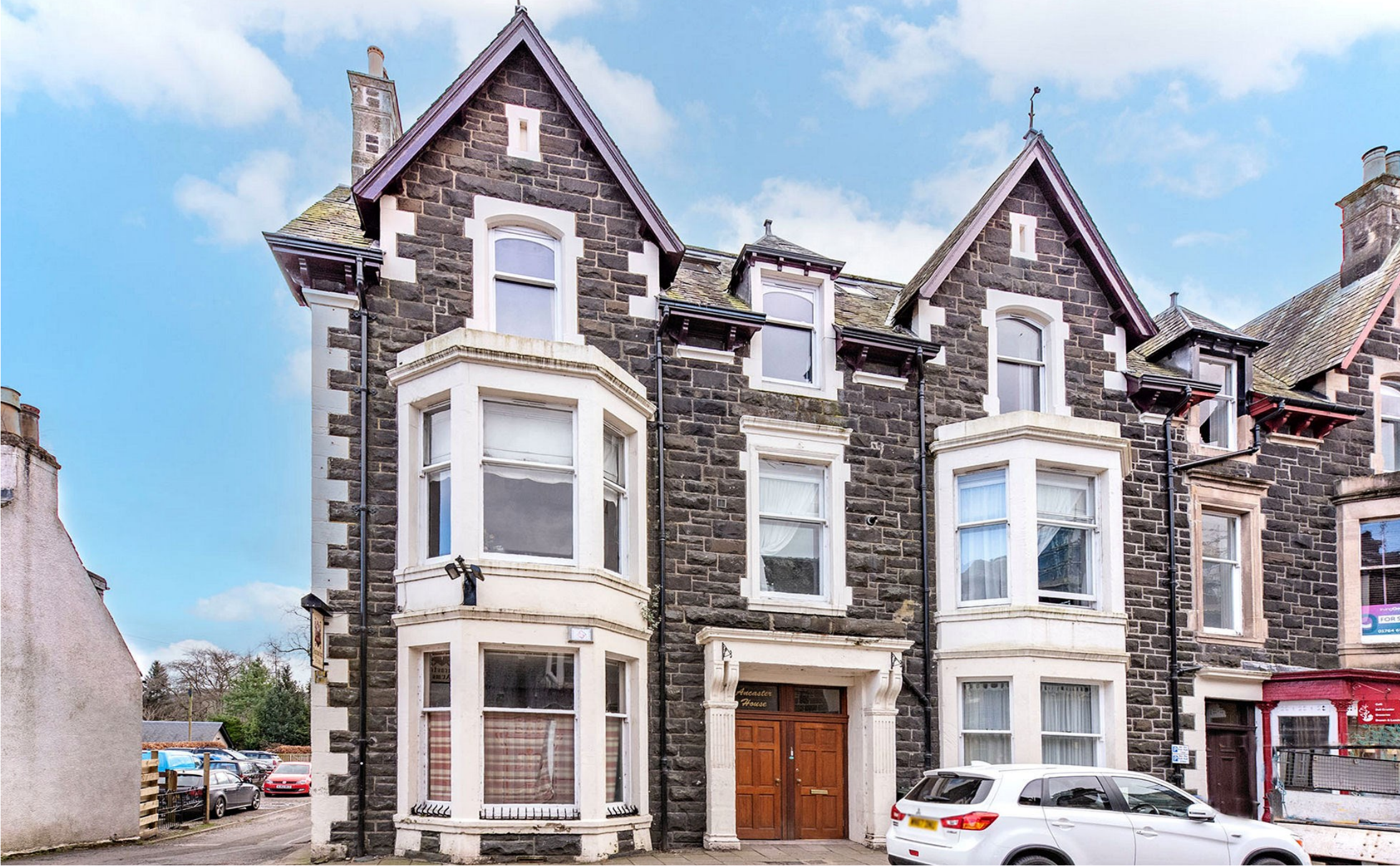
1 ANCASTER HOUSE DRUMMOND STREET, COMRIE, PERTHSHIRE, PH6 2DF

Irving Geddes W.S. • Solicitors • Estate Agents