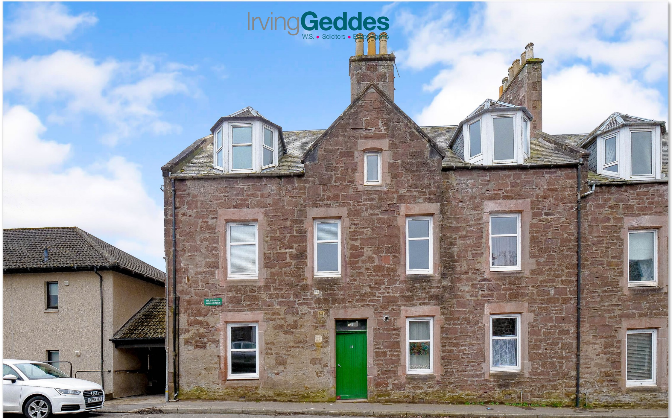
TOP LEFT, FLAT 5 18, MILNAB STREET, CRIEFF PH7 4BH